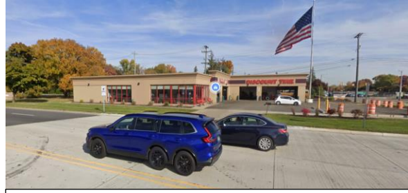
NE Corner of Southfield & 11 Mile Road

For comparison, hours of operation for small box retail discount stores in Southfield are limited to 8:00 a.m. to 10:00 p.m.