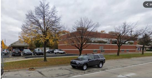
NW Corner of Southfield & 11 Mile Road