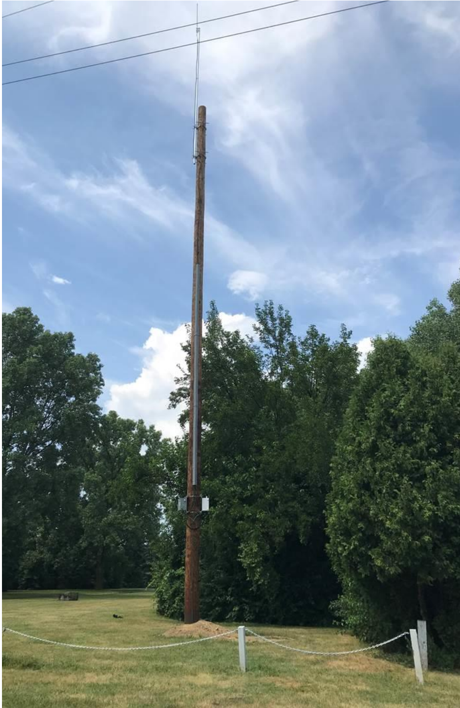
EXAMPLE – Class II Pole Installation

City of Lathrup Village 27400 Southfield Road Lathrup Village, MI 48076 www.lathrupvillage.org | (248) 557-2600