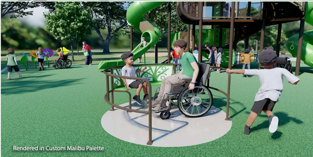
Rendered in Custom Malibu Palette