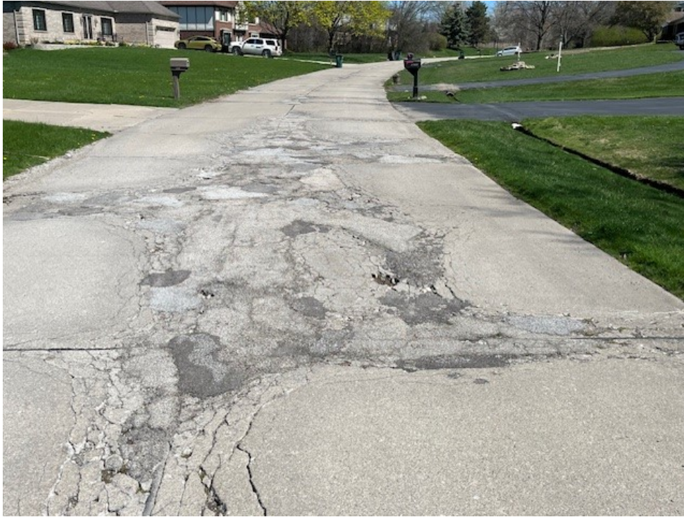
Rainbow Circle (Midblock to Red River) Looking Northeast – Concrete Reconstruction