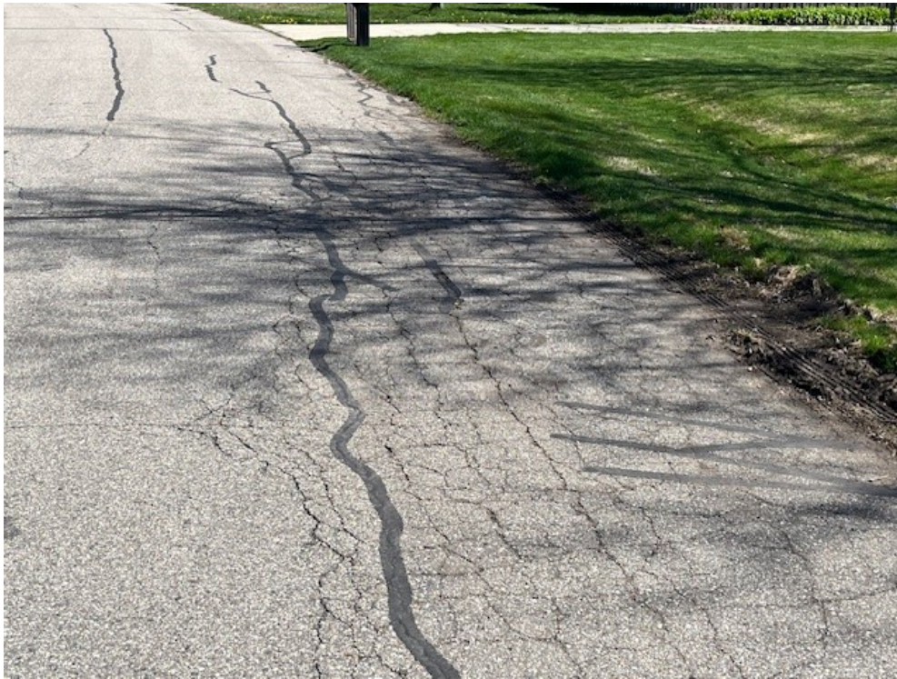
Rainbow Circle (Red River to Midblock Rainbow Circle) Looking West - Asphalt Mill / Overlay Section