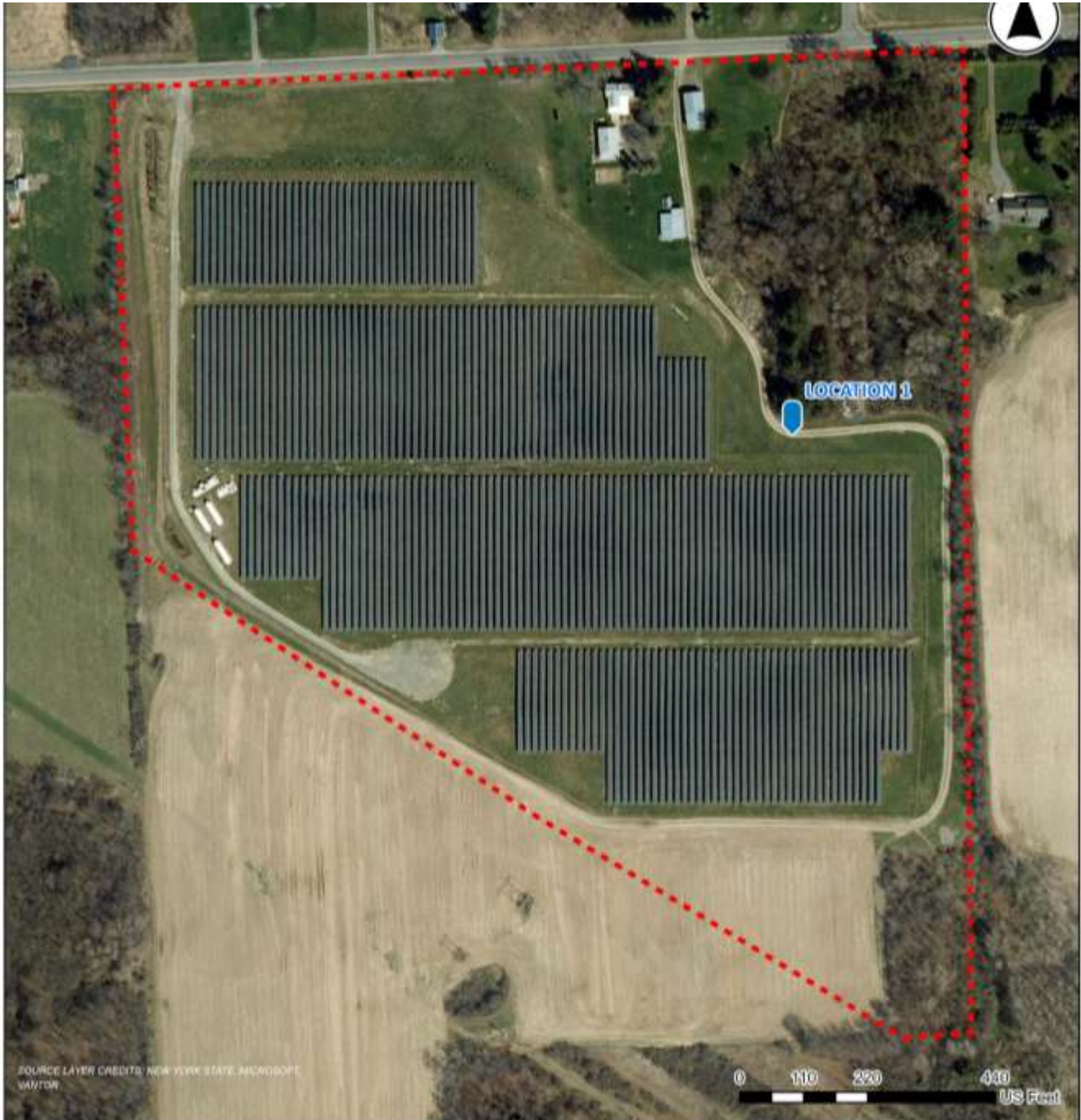
Figure 3 – Noise Monitoring Location