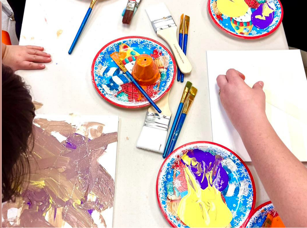
The children and their grown-ups in our monthly Pre-School Play group had a lot of fun creating their own pumpkins with terra-cotta pots.