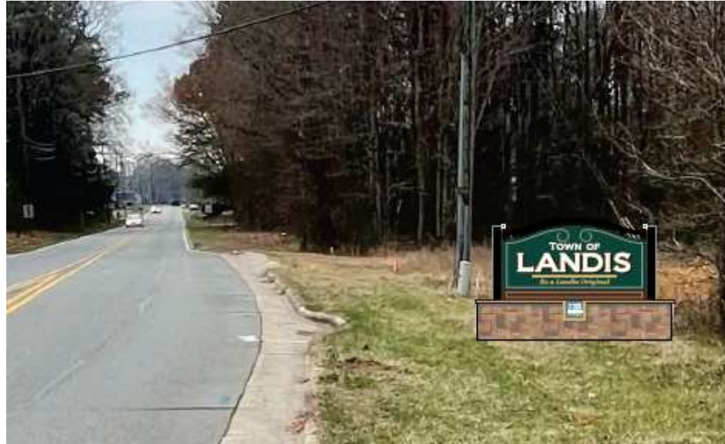
New Proposed Location: 1780 S. Main Street