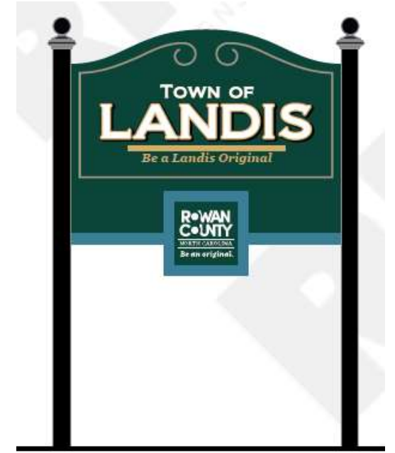
New proposed signs to replace existing small Landis signs