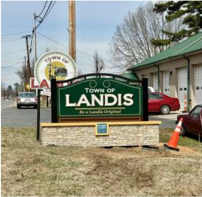
Welcome Sign Installed 2/18/2025