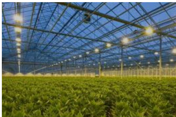
Large Agricultural Operation

Uses permitted by right (need to apply for a zoning and building permit)