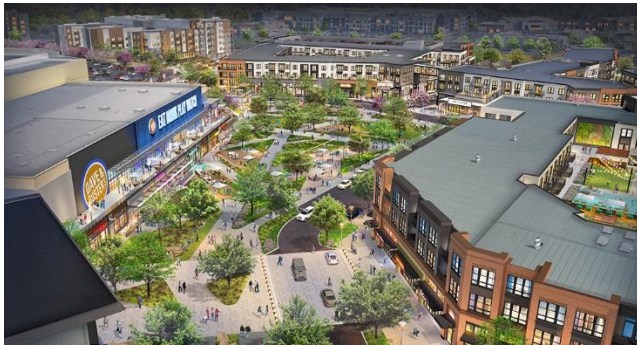
Conceptual Mixed-Use development