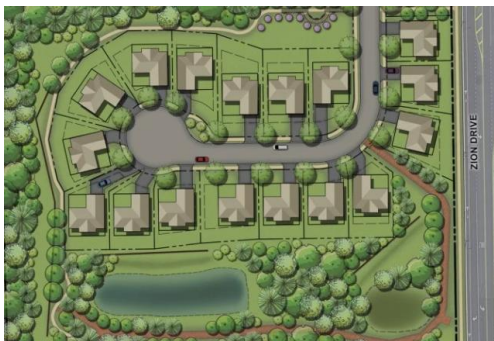
Single Family Residential

The Single-Family Residential districts provide for the completion of existing residential neighborhoods and the development of new residential neighborhoods. Allowed building/lot types in the Single-Family Districts are Detached House. Listed uses are restricted to Single-Family, including duplex (two-family), homes and their accessory uses. Neighborhoods in these districts are the dominant land use in Landis and are a major element in defining the character of the community. Standards for the Single-Family Residential Districts promote that new development maintains the character of the community. The Single-Family Residential Districts permit the completion and conformity of conventional residential subdivisions already existing or approved in sketch plan form by the Town of Landis prior to the effective date of these regulations.