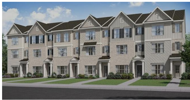
Single Family Residential Attached/Townhomes