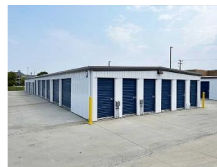
Self Storage Facility

Uses permitted by right (need to apply for a zoning and building permit)