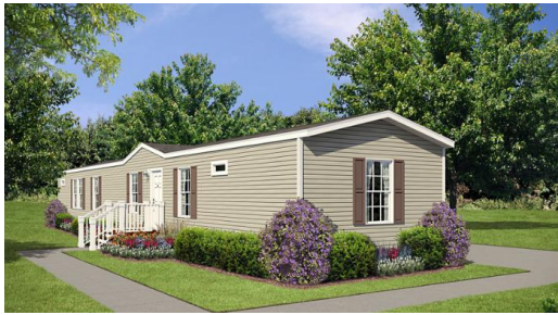
Single Wide Mobile Home

The Manufactured Home Overlay district is established to protect the standard of living and neighborhood conditions. Established standards that will enable the use of innovative manufactured homes with a higher aesthetic standard will invigorate these communities. Non-conforming manufactured home parks that have not received approval for continuation would be amortized over a period of time to allow the owner/operator to meet reasonable financial payback expectations in accordance with accepted practices in North Carolina. Existing parks could be limited to less fundamental standards and specifications, while new parks are required to meet a higher standard. These parks may be ideally suited for alternative designs such as Tiny House, Park Model and other styles of housing where installation standards are considered temporary. The overlay could be expanded to apply to permanent installations of innovative manufactured housing in subdivisions or parks in accordance with G.S. 160D-909.