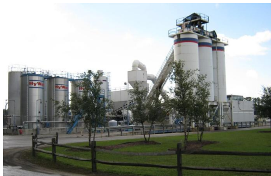
Large Industrial Operation

The Heavy Industry Overlay district is established to protect all environments from the negative impacts of certain activities and types of development. It is the intent of this district to provide and permit certain public and private heavy industrial uses and facilities that incorporate hazardous materials and/or scientific technology, including wholesale, distribution, storage, processing, manufacturing and production. However, it is required that industries in this district take all necessary actions including but not limited to installation of apparatus and technological equipment available to prevent negative impacts on the environment and the community from the emissions of smoke, dust, fumes, noise and vibrations and other activities and/or products resulting from such hazardous industrial activities in accordance with federal, state and local regulations.