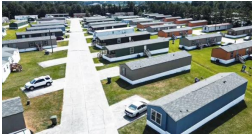
Mobile Home Park

Uses permitted by right (need to apply for a zoning and building permit)