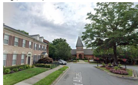
Neighborhood Church (St Albans, Davidson)