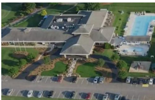
Country Club/Golf Courses