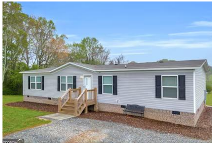
Double Wide Mobile Home