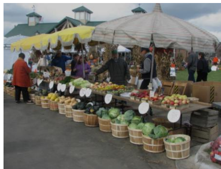
Farmers Market (agricultural support uses)