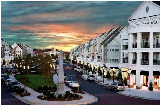
Birkdale Village (Huntersville)

The Mixed-Use districts are established to provide opportunities for both compatible and sustainable re-development where underutilized commercial properties already exist as well as infill sites where site specific land planning of new development creates opportunities for businesses and various housing designs sharing community amenities and enhancements. Existing auto-oriented streets, lot, and building designs can create uncomfortable pedestrian environments; however, with careful site planning these areas will allow a greater number of residents to walk or bike to businesses and services with an interconnected network of streets and sidewalks. Allowed building/lot types are Highway Commercial, Urban Workplace, Shopfront, Detached House, Attached House, and Multi-family. Dominant uses in this district are residential, retail and office. The Mixed-Use Districts are expected to serve Landis residents as well as people who travel from surrounding communities. The development pattern in this district acknowledges the role of the automobile, with parking and access provided to promote safety for the motoring public. Development standards in the Mixed-Use Districts promote the creation of a pleasant pedestrian-friendly auto-oriented environment while enabling a compatible transition to uses in adjacent neighborhood districts.