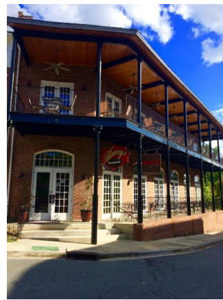
Commercial center (Vermillion)