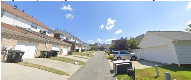
Alleys (Afton Village, Concord)