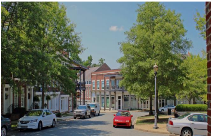
Mixture of residential and commercial (Vermillion, Huntersville)

The TND Overlay provides for the development of new neighborhoods and the revitalization or extension of existing neighborhoods. These neighborhoods are structured upon a fine network of interconnecting pedestrian-oriented streets and other public spaces. Traditional Neighborhood Developments (TND's) provide a mixture of housing types and prices, prominently sited civic or community building(s), stores/offices/workplaces, and churches to provide a balanced mix of activities. A Traditional Neighborhood Development (TND) has a recognizable center and clearly defined edges; optimum size is a quarter mile from center to edge. A TND is urban in form, is typically an extension of the existing developed area of the Town and has an overall residential density of up to eleven (11) dwelling units per acre. TND districts should have a significant portion of land dedicated to improved open spaces, and reserve un-improved open spaces where environmentally sensitive areas are located.