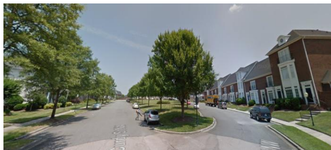
Village Green (Afton Village, Concord)