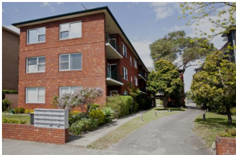
Small Multi-Family Residential