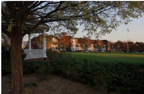
Village Green (Afton Village, Concord)