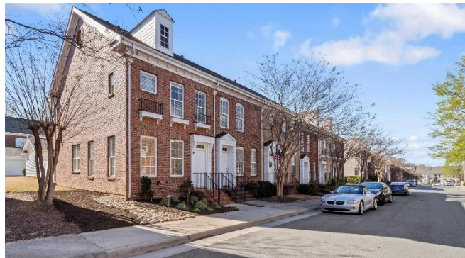
Morrison Plantation (Mooresville)