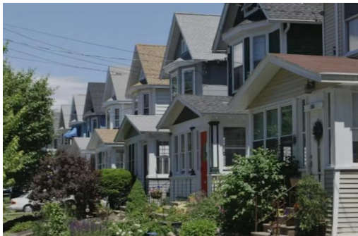
Single Family Residential

The Residential Main Street Transition district provides for the completion of residential neighborhoods in the residential area(s) surrounding the Main Street and contiguous Civic Districts through in-fill development. The intent of this district is to recognize that gradual transformation of existing development to high quality mixed density residential development is needed to support the central core of the Town. Higher density residential development allows a greater number of households to walk or bike, thus supporting businesses while reducing the parking demand and providing environmental and health benefits. Allowed building/lot types in these districts are the Detached House, Attached House, and Multi-family Building. Streets in the Residential Main Street Transition District should be interconnected, with streets and sidewalks providing a connection from Landis's Main Street and other mixed-use districts to the Single-Family Residential districts surrounding these neighborhoods. A range of housing types is encouraged. Criteria for the mix of building types establishes compatibility.