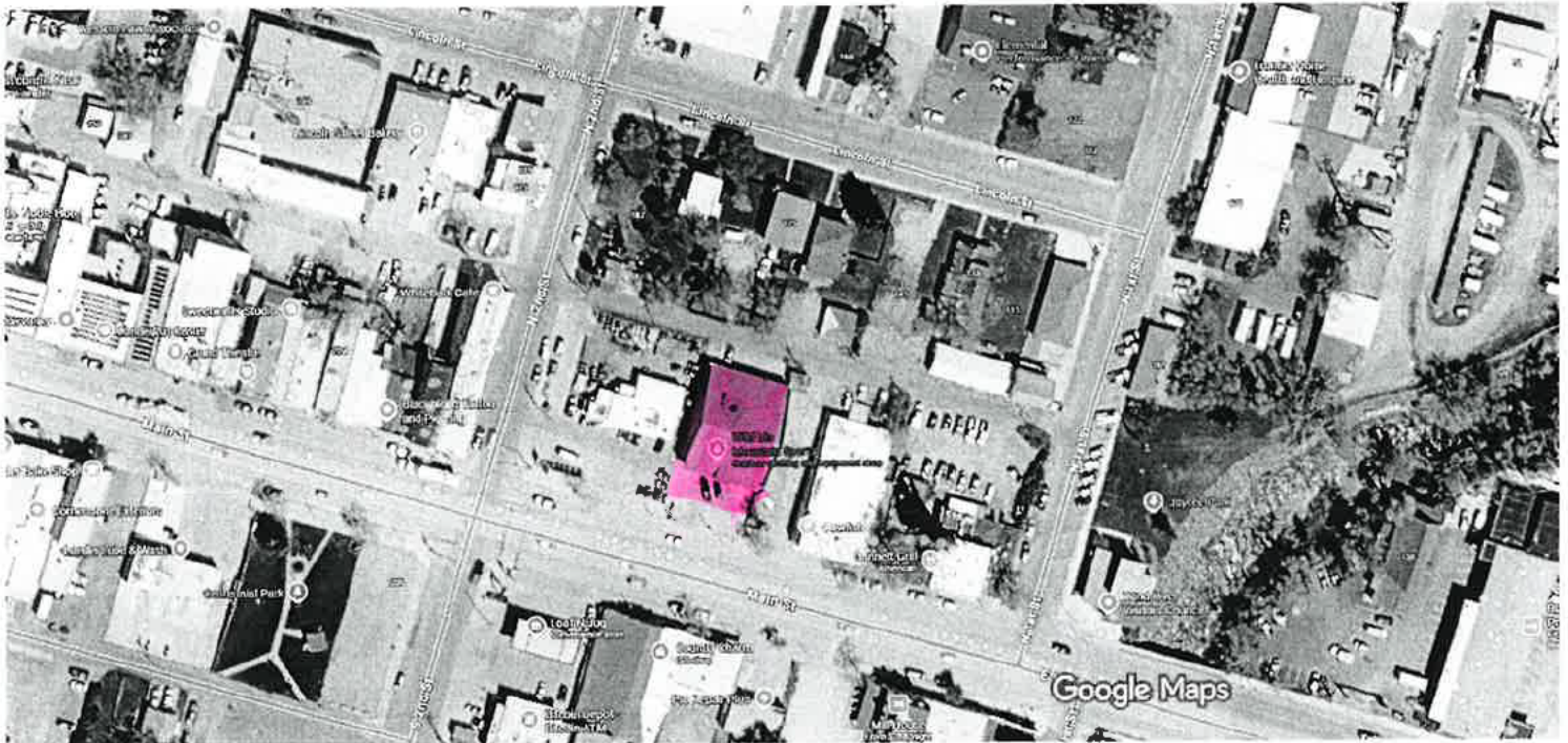
Imagery ©2026 Airbus, Maxar Technologies, Map data ©2026 Google 50 ft