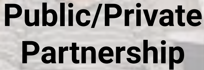
Table Mountain Living Community