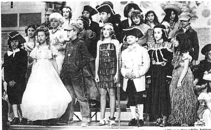
Local celebrations took precedence in Wyoming. Above, costumed school children sang at Wamsutter while, below, an old-time dance brought cowboys—and their horses—to the town hall at Lost Springs, nation's smallest Bicentennial community.