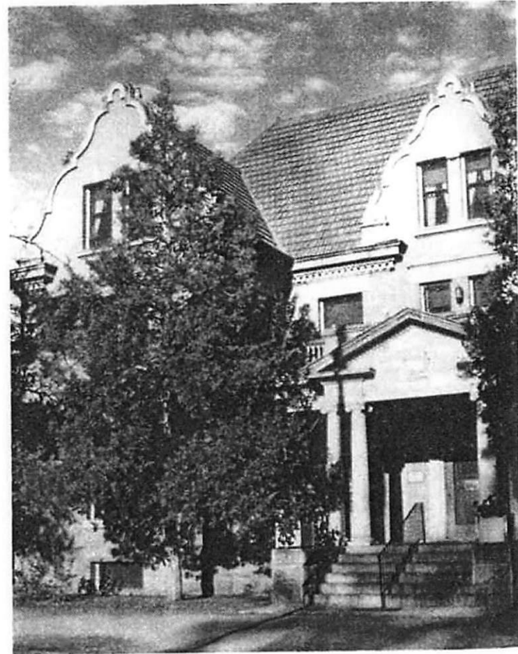
"Trail End", Mansion Home of cattleman John B. Kendrick (also Wyoming Governor and U. S. Senator) was saved when an ARBA grant of $12,000 to pay off the mortgage was given to the Sheridan County Historical Society. The Society has preserved the home as a museum.