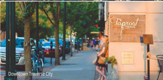
Downtown Traverse City