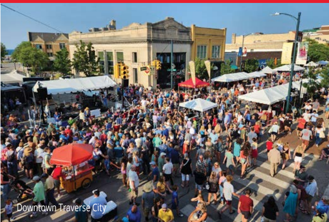
Downtown Traverse City