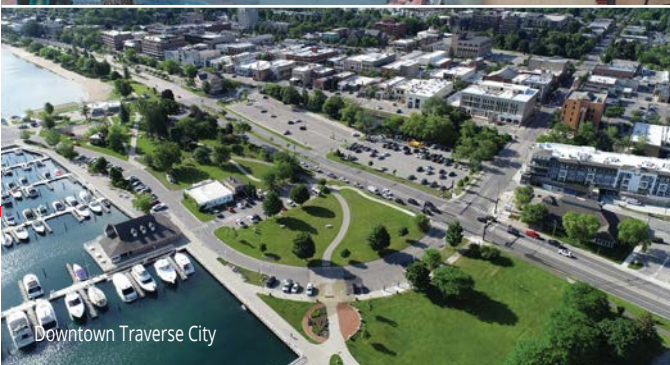
Downtown Traverse City