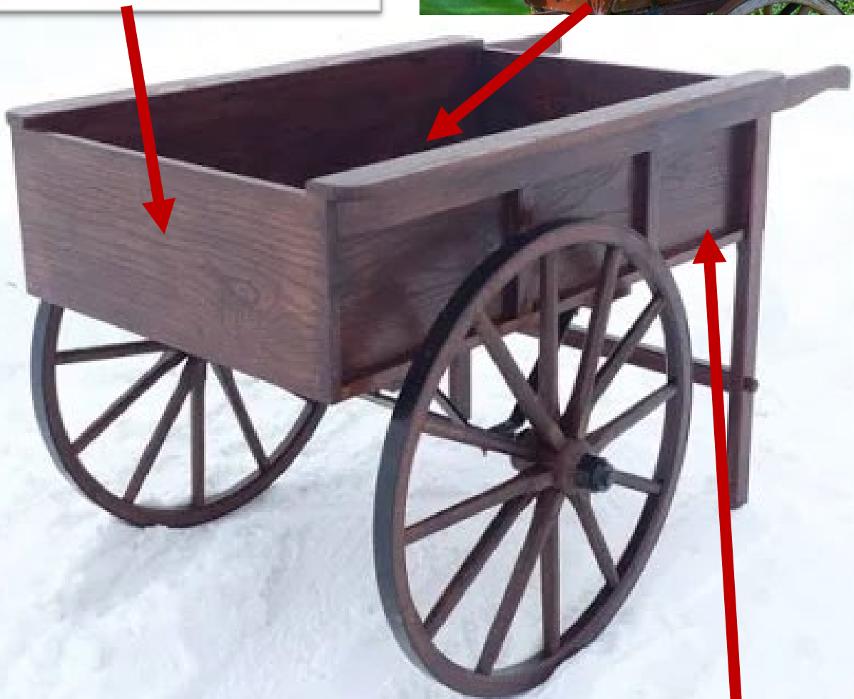
Large Peddler Cart