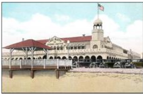
Lake Worth Beach Casino 1920s