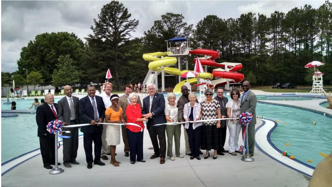
Seven Springs Water park - Powder Springs GA