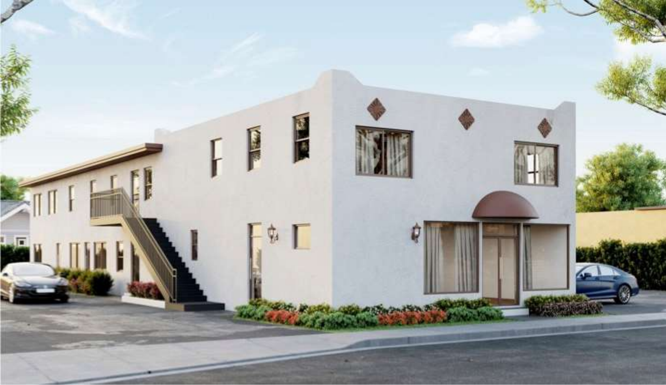
Proof of Concept in Delray Beach, FL