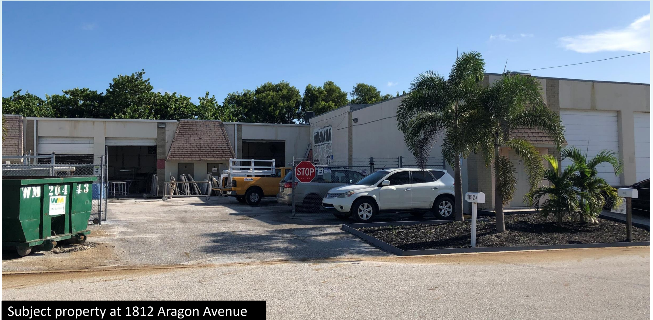
Subject property at 1812 Aragon Avenue