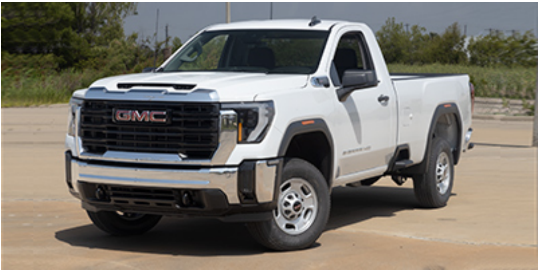
Note:Photo may not represent exact vehicle or selected equipment.

Vehicle: [Fleet] 2026 GMC Sierra 2500HD (TC20903) 2WD Reg Cab 142" Pro (✔ Complete )