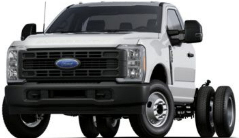
Note:Photo may not represent exact vehicle or selected equipment.

Vehicle: [Fleet] 2026 Ford Super Duty F-350 DRW (F3G) XL 2WD Reg Cab 169" WB 84" CA ( Complete )