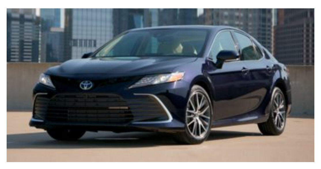
Note:Photo may not represent exact vehicle or selected equipment.