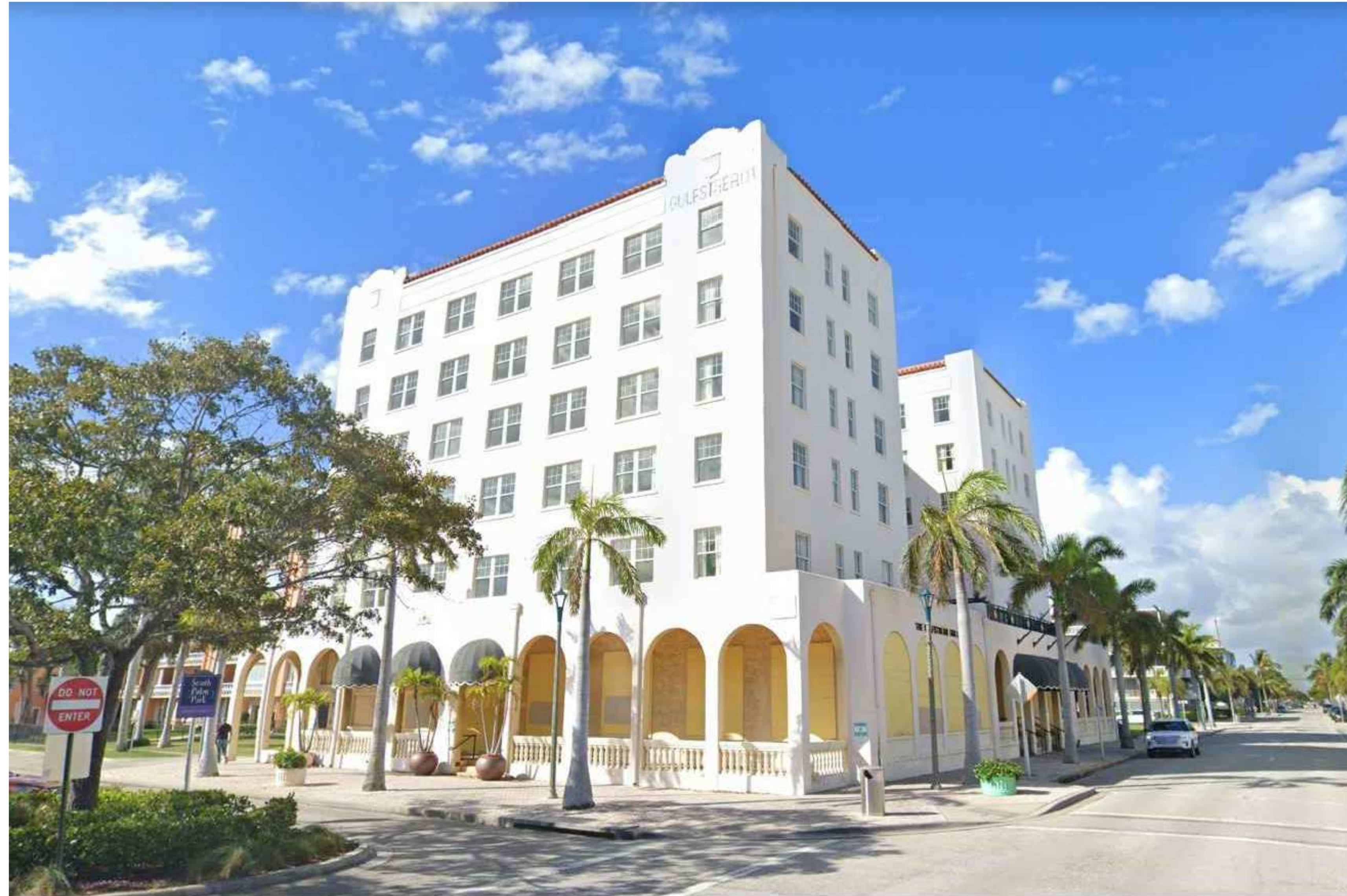
GULFSTREAM HOTEL DEVELOPMENT LAKE WORTH, FL.