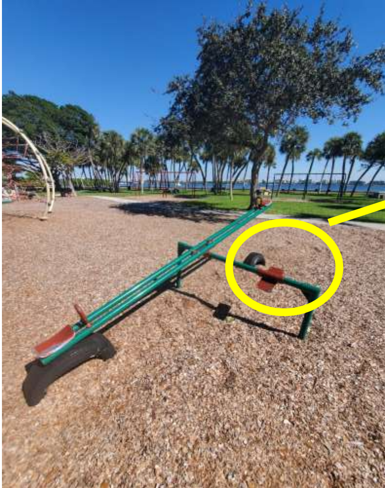
Fig 6.1 Current condition of see-saw