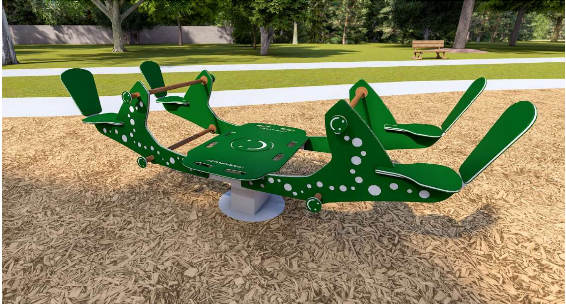
Fig 9.1 New see-saw