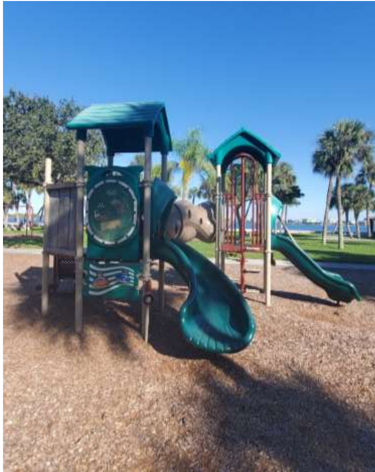
Fig 5.1 Current condition of playground