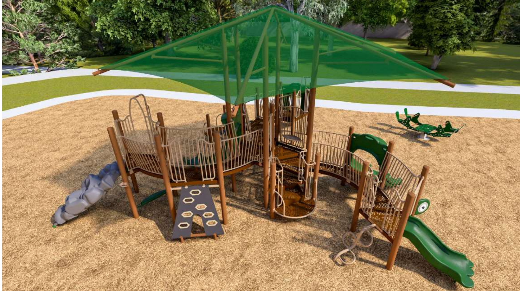
Fig 7.1 New Structure front view

New Structure will have three slides in comparison to two slides.