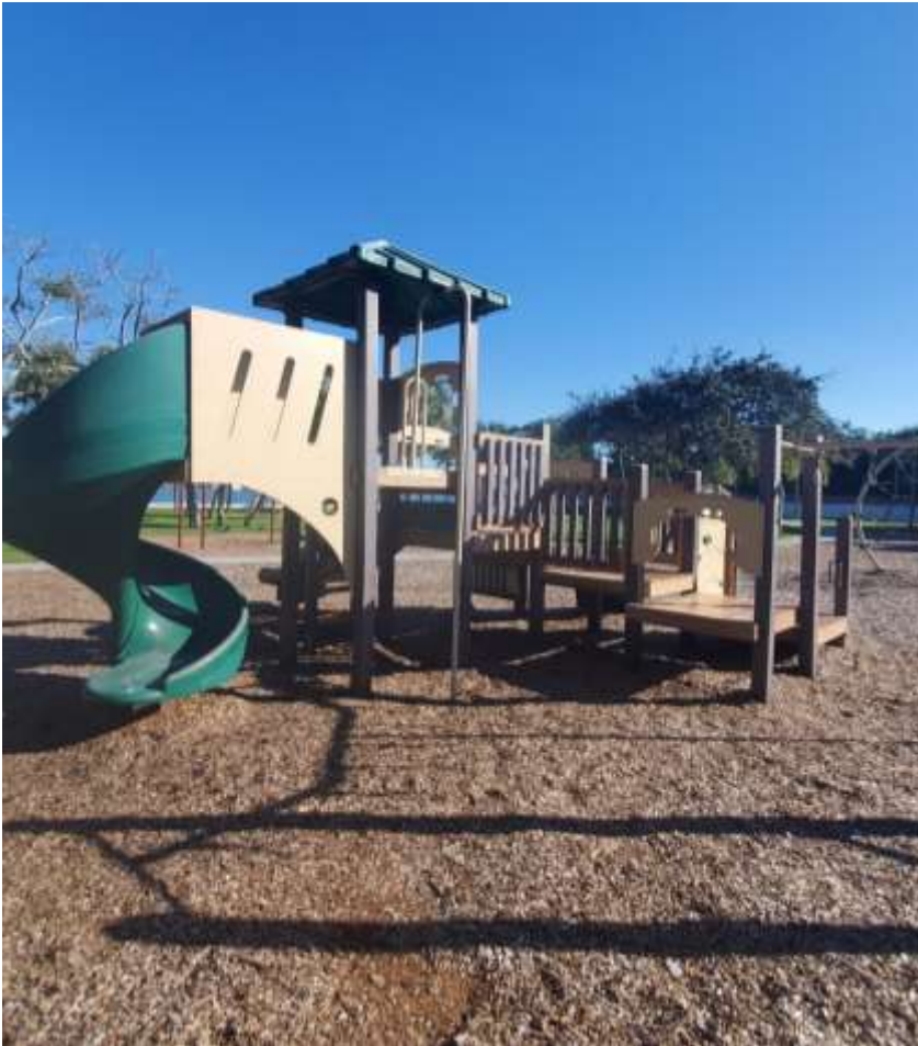
Fig 10.1 Current North structure will remain