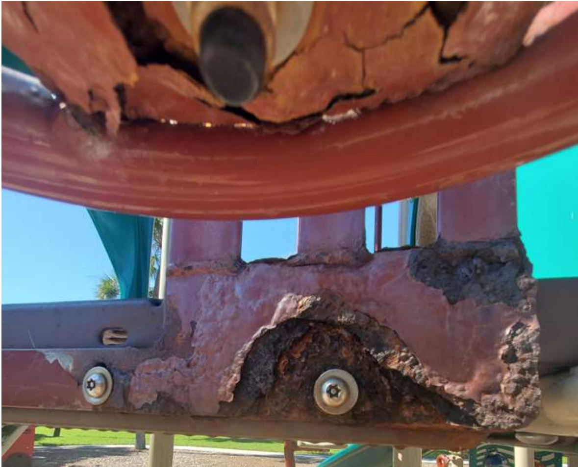
Fig 4.1 Corrosion of play piece number 1