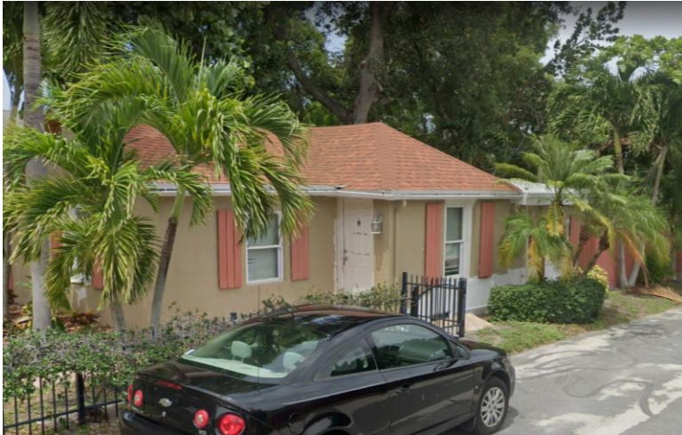
Exhibit 1 – Existing Front Door