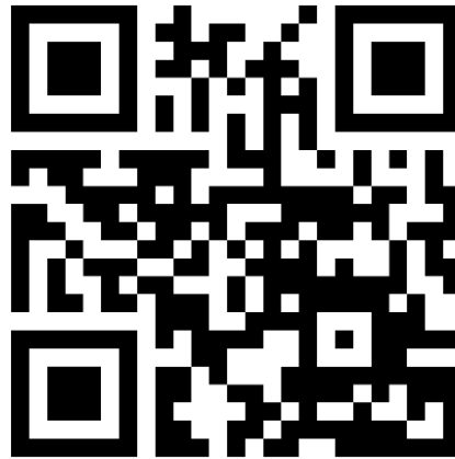
QR CODE TO BE UPDATED

Please see the following QR Code to the survey, which will provide the City with prioritized action items from your community.