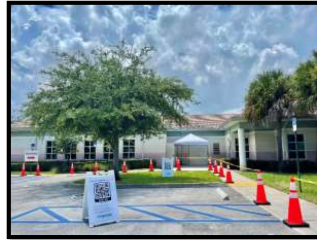
The Dept of Health PBC used Mid-County Senior Center for COVID Testing