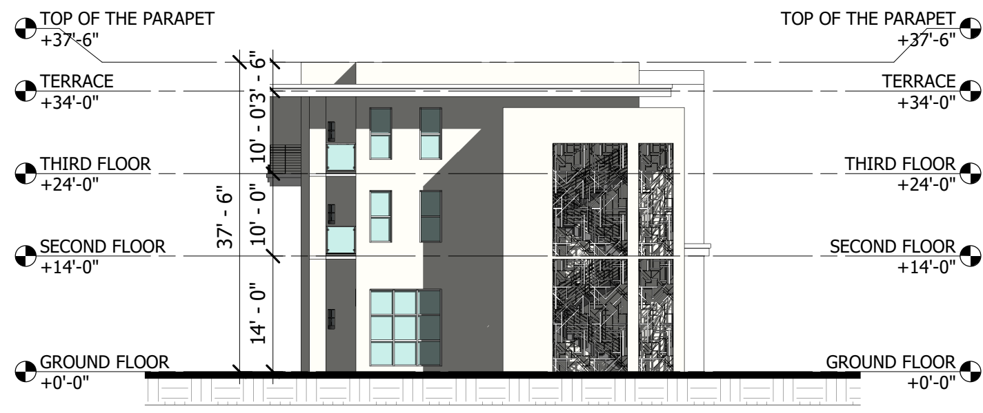
1 BLDG 4 - NORTH ELEVATION SCALE : 1/16" = 1'-0"

A3.04 © 2021, The Martin Architectural Group, P.C.