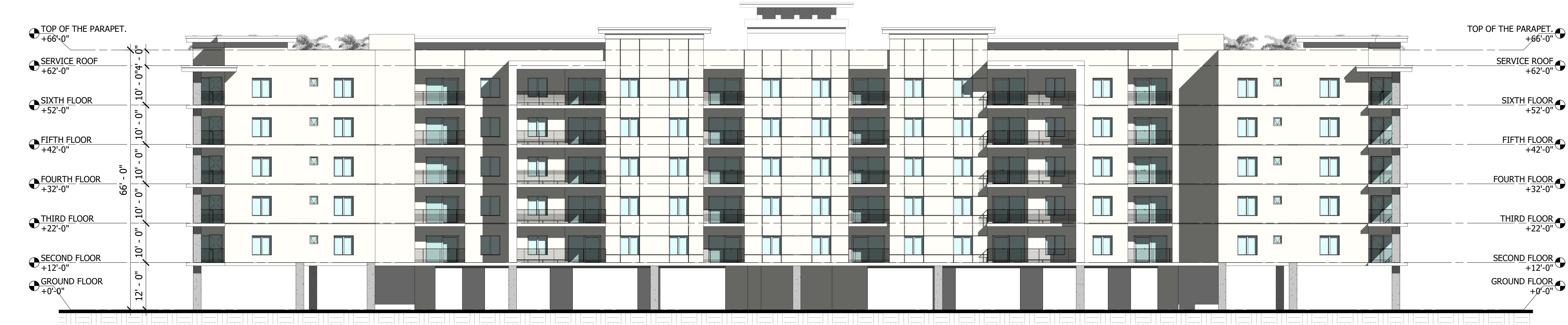
2 BLDG 2 - WEST ELEVATION SCALE : 1/16" = 1'-0"