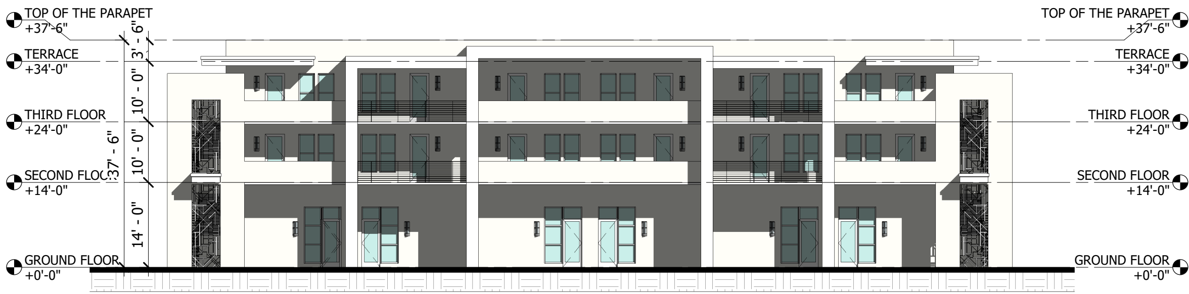
3 BLDG 4 - WEST ELEVATION FACING INTERIOR PLAZA SCALE : 1/16" = 1'-0"