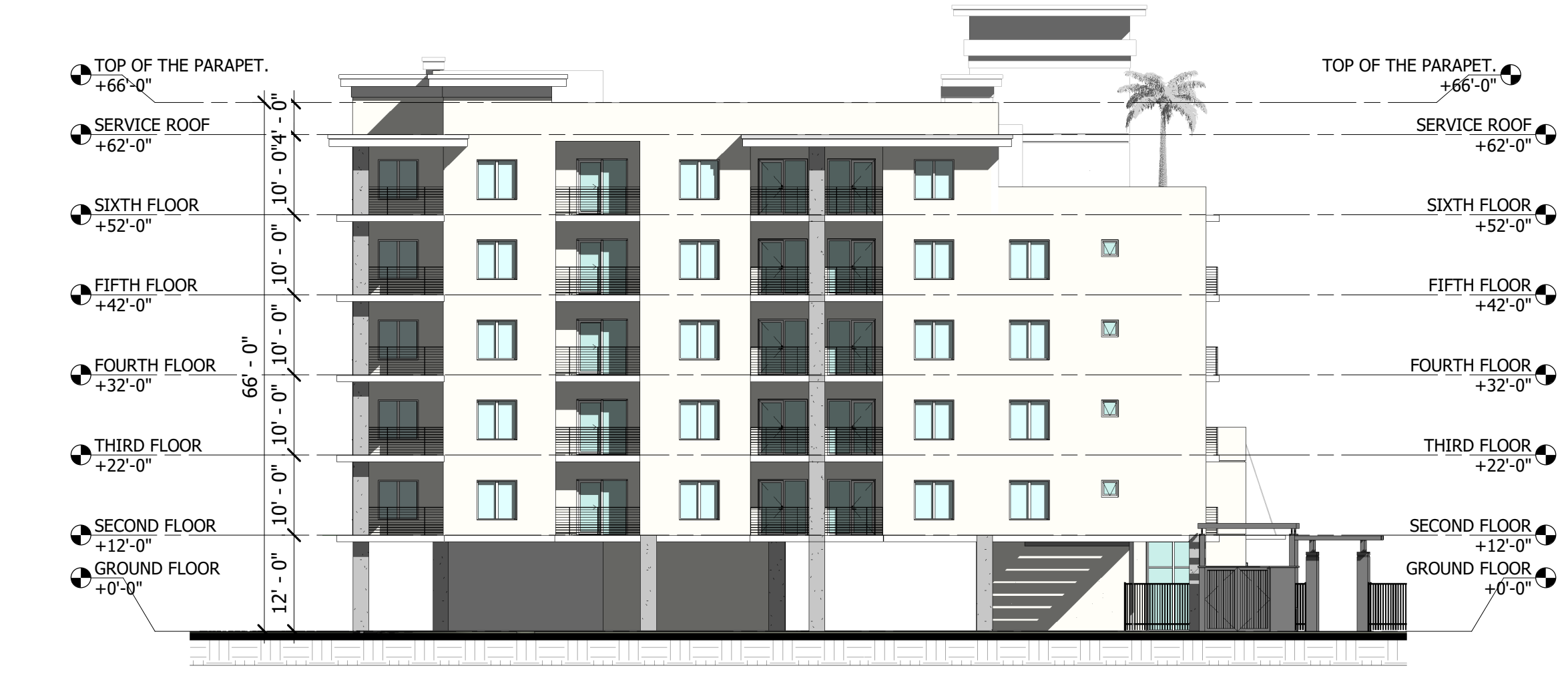
4 BLDG 2 - SOUTH ELEVATION SCALE : 1/16" = 1'-0"

NOTE: • BUILDING 1 AND 3 ARE MIRROR • BUILDING COLOR WILL BE WHITE W/ ACCENT COLORS. • THESE ELEVATIONS ARE IN GRAY FOR REPRESENTATION ONLY. REFER TO THE RENDERINGS.