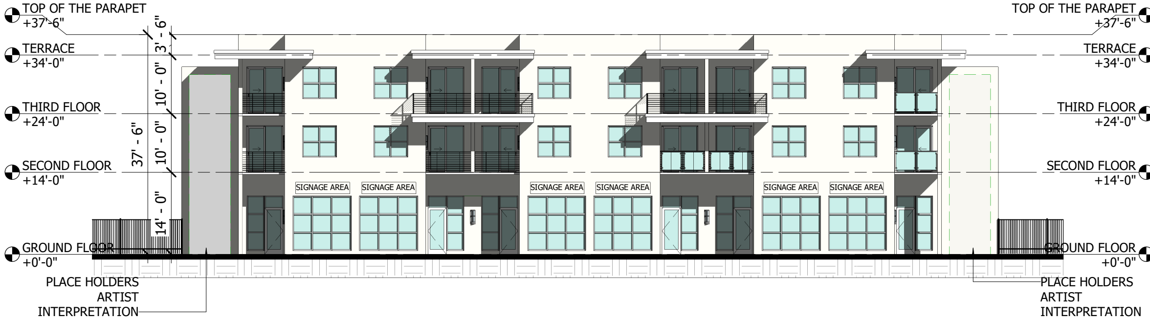
4 BLDG 4 - EAST ELEVATION - DIXIE HIGHWAY SCALE : 1/16" = 1'-0"