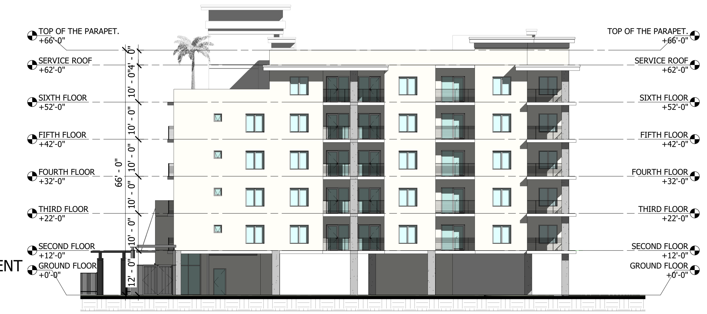
3 BLDG 2 - NORTH ELEVATION SCALE : 1/16" = 1'-0"