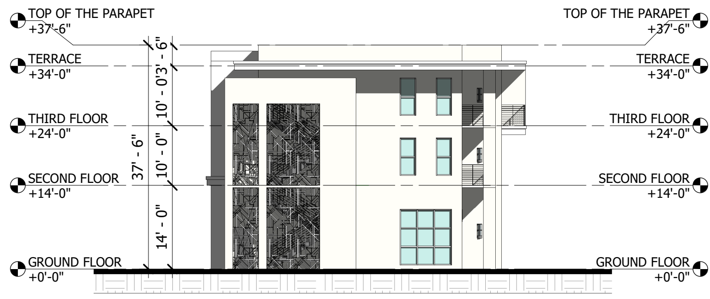
2 BLDG 4 - SOUTH ELEVATION SCALE : 1/16" = 1'-0"