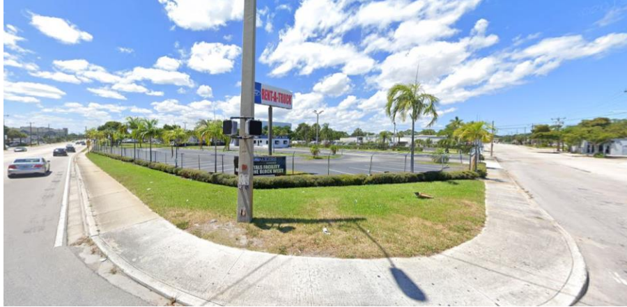
SE looking NW