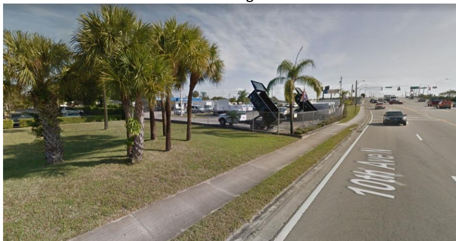
SW looking NE

Corporate Office 301 E. Atlantic Blvd Pompano Beach FL 33060 954.788.3400