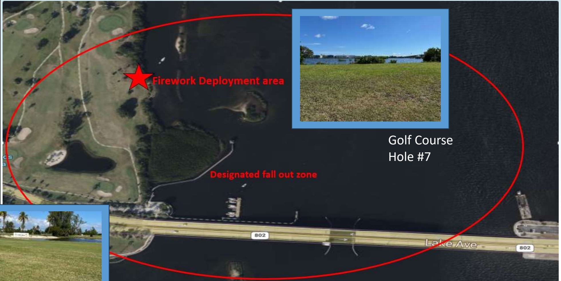
Golf Course Hole #7