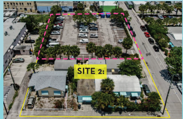
This is Site 2 from the original 2020 RFP – parcels located along K Street at 1st Avenue S