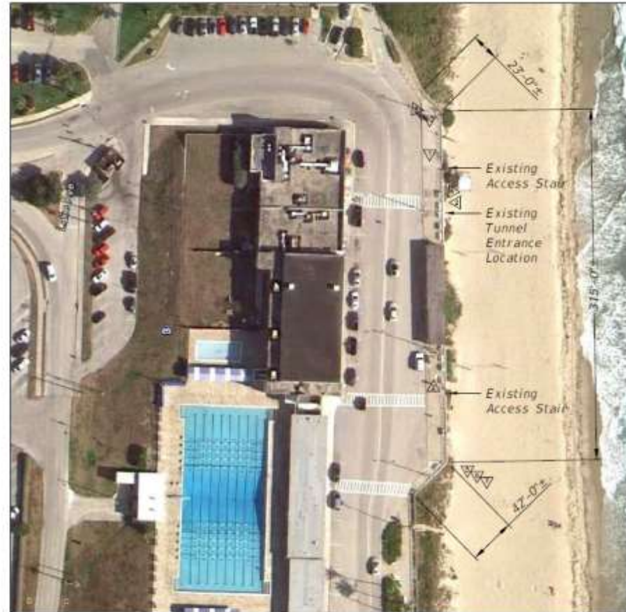
Repair Location Map