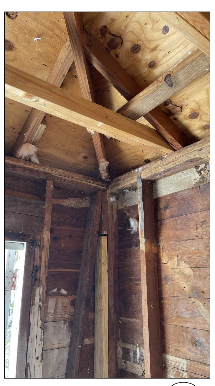
EXISTING PICTURE P5