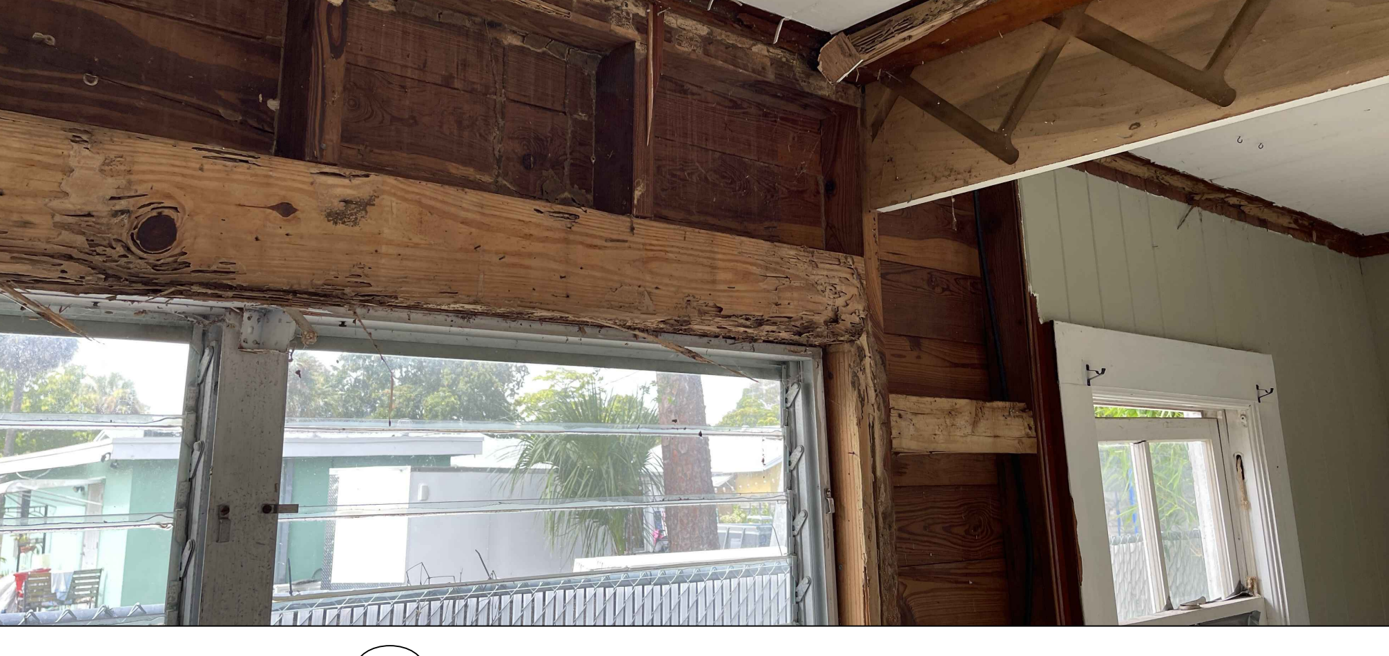
EXISTING PICTURE (P18)