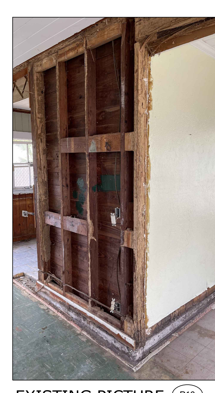
EXISTING PICTURE (P16)