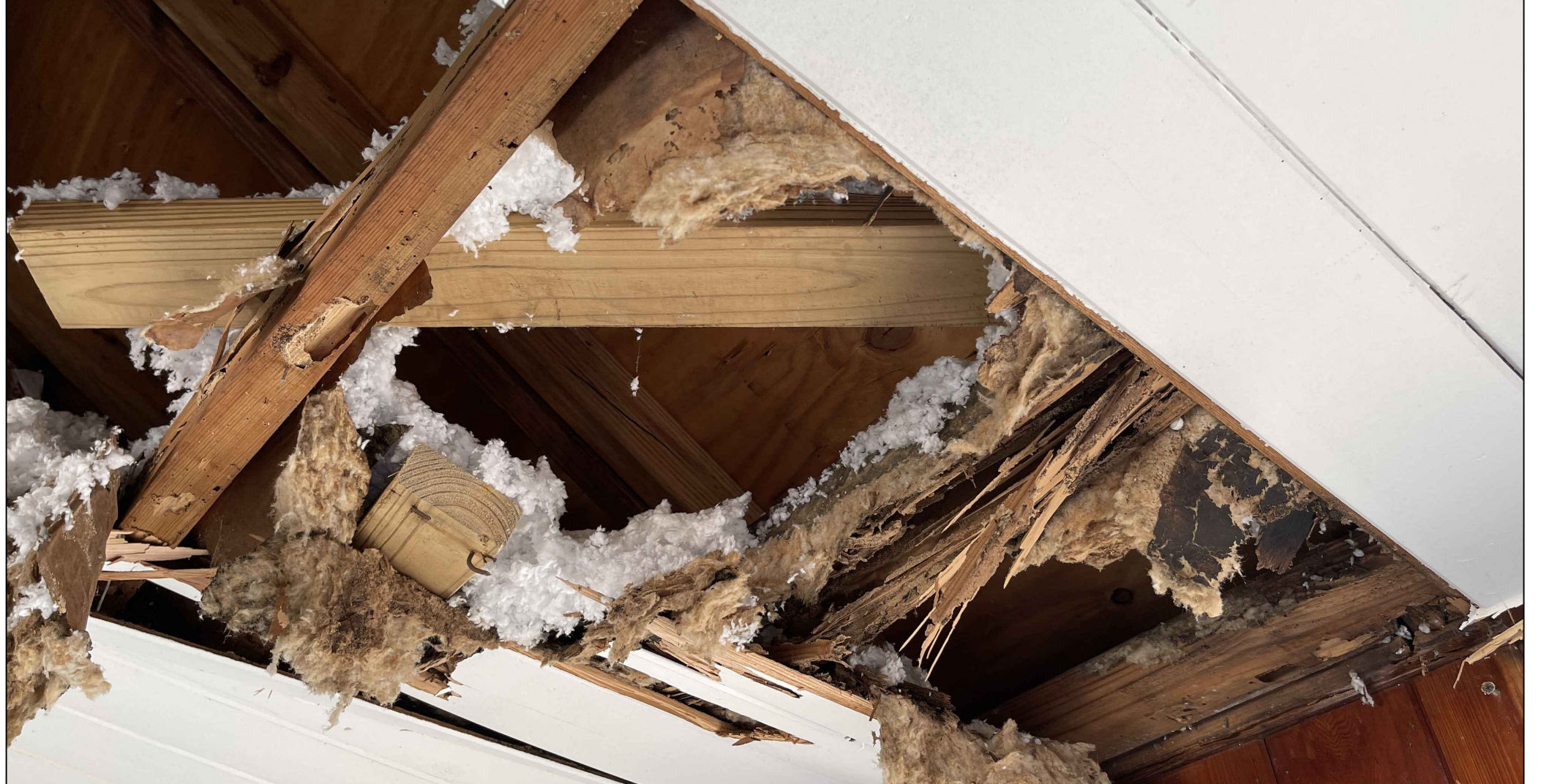
EXISTING PICTURE (P14)