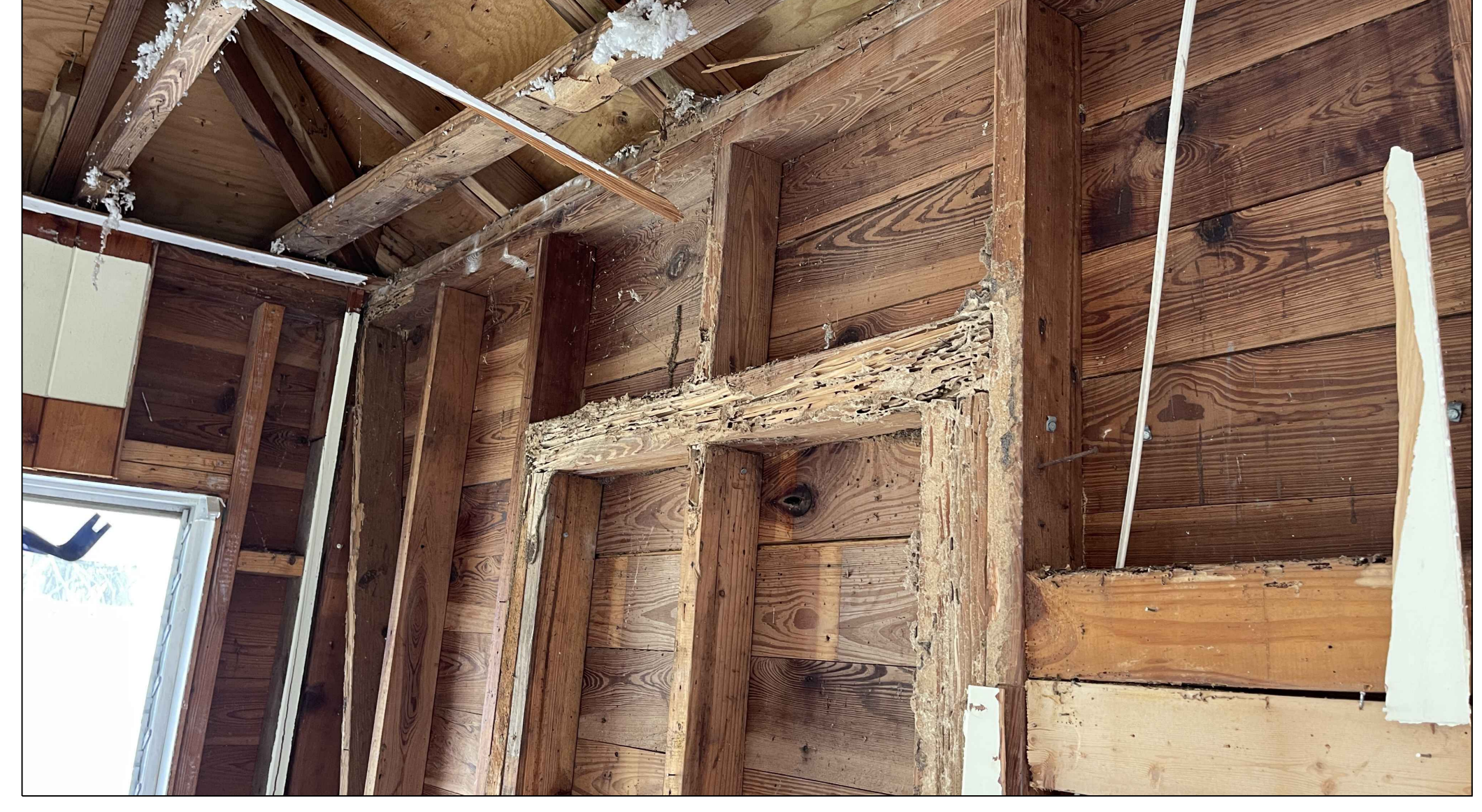
EXISTING PICTURE (P12)