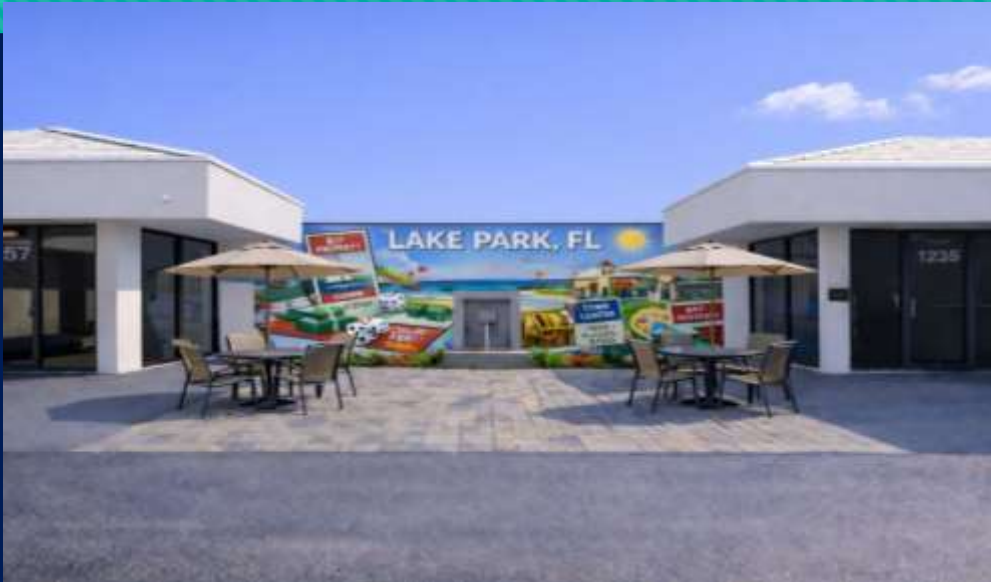
Plaza – Fountain and Mural