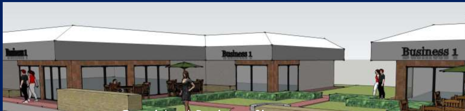
Consistent Business Signage