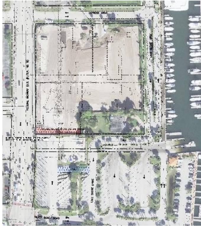
Figure 3: Circulation Exhibit

Notably, construction plans include building a temporary road for Bayberry in Spring/Summer 2023. Once completed the road will be used for construction purposes only until the end of the project and will be fenced off for safety purposes. No access will be available from the trailer parking lot to Bayberry until the end of the construction. Construction is anticipated to end between 4 th quarter 2024 and 1 st quarter 2025.