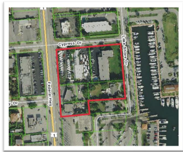
Figure 1: Subject Site

The site has a Federal Highway Mixed Use Future Land Use designation and is located within the Mixed-Use Zoning District and Federal Highway Mixed Use District Overlay.