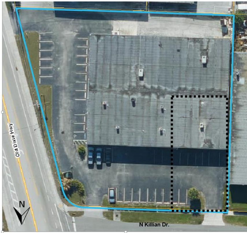
Kustom Kings Elevation 1360 N Killian, unit 3