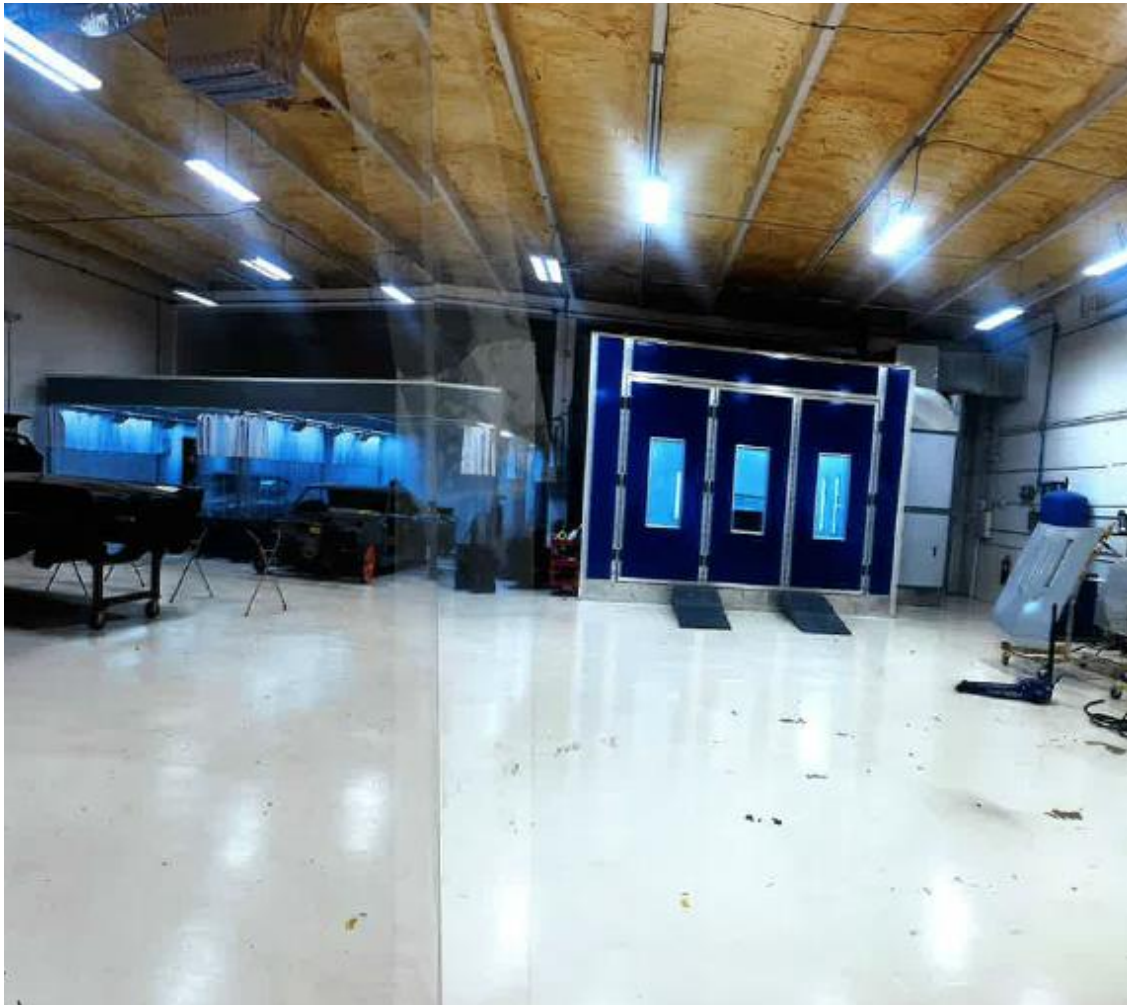
Interior, showing sanding/prep booth on the left and spray booth on the right.