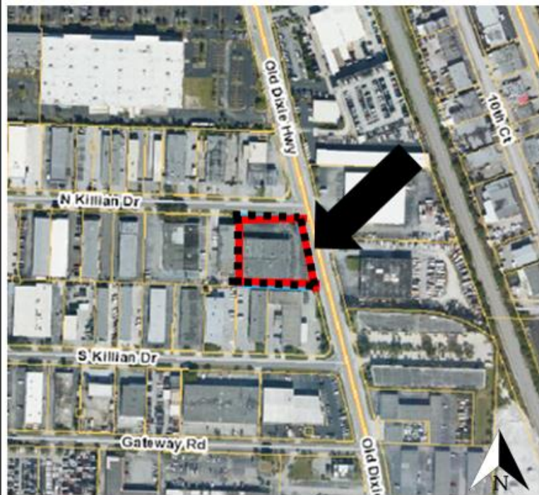
Location: 1360 N Killian Drive, #3.

Applicant: Kustom Kings, Inc. Property Owner: JB Parasmu LLC PCN: 36-43-42-20-09-000-0460 Property size: 1.12 acres