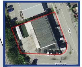
AERIAL PHOTOGRAPH (NOT-TO-SCALE)