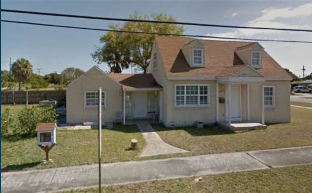
307 Fourth Street

There are other Little Free Libraries in town without charters. These are the ones that we know of.