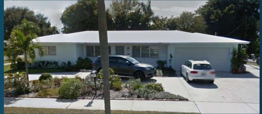
214 Hawthorne Drive

A service project by a homeschooler, it was taken down before a hurricane and hasn't been reinstalled. This does have a charter, but for some reason isn't on the map.