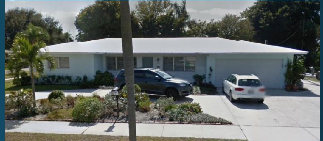
214 Hawthorne Drive

A service project by a homeschooler, it was taken down before a hurricane and hasn't been reinstalled. This does have a charter, but for some reason isn't on the map.