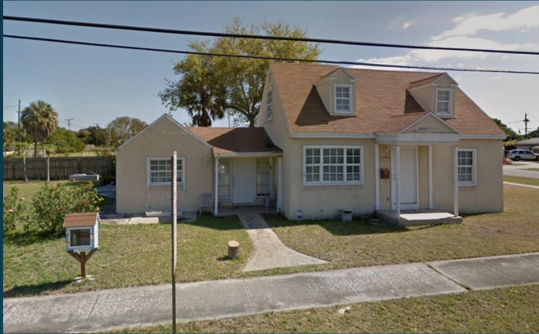
307 Fourth Street

There are other Little Free Libraries in town without charters. These are the ones that we know of.