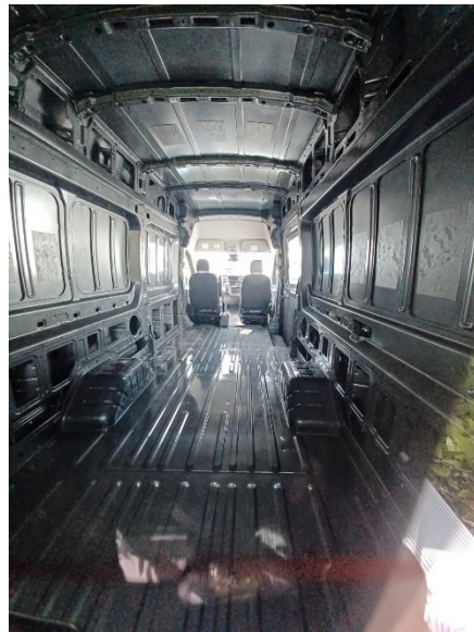
Figure 2. Cargo Van Interior

The proposed upgrades, totaling $15,872.97 , will promote safety, productivity, and efficiency for assigned maintenance personnel, while also protecting fragile, temperature sensitive and costly inspection equipment.