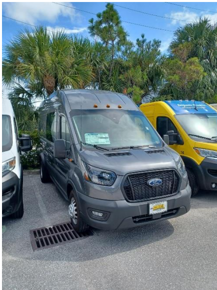
Figure 2. Cargo Van Exterior

As part of FY-2024 budget preparation, department staff researched and requested a cargo van to better support the wide-ranging maintenance operations for the division. Accordingly, the van must now be outfitted with safety and maintenance equipment, including emergency/safety lighting, workstation with tool drawers, ladder rack, insulated walls, and ceiling, among other enhancements.