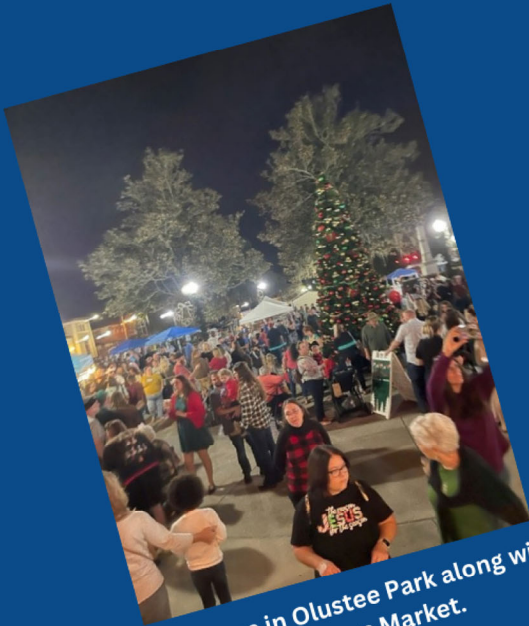
Lighting of the tree in Olustee Park along with an evening Farmers Market.

Farm to Table is inspired from Columbia County's deep roots in agriculture which once defined the way of life here! From row crops, vegetables, pine trees, cattle, poultry, dairy, swine, turpentine, honey and more ... Our farmers contribute greatly to the quality of life in this County. Today local farming is still a vital legacy and Farm to Table was created to celebrate and pay tribute to our farmers and agricultural community. Without them, where would we be? Farm to Table is here to showcase our agriculture community, recognize our talented culinary chefs, and to support the entrepreneurial spirit in our community. Farmers and entrepreneurs work closely together to produce honey, goat cheese, dairy products, jam, vegetables, fruits, hot sauce, soap, and more. This is what makes Columbia County and Lake City ... Our rural home.