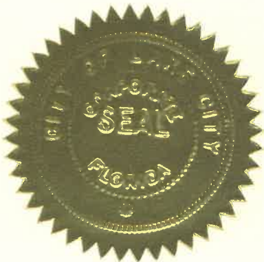
Seal of the City of Lake City State of Florida