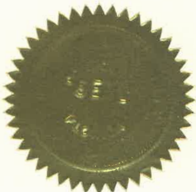
Seal of the City of Lake City State of Florida

I further call upon all citizens of the City of Lake City to observe, Monday, May 15 th , as Peace Officers' Memorial Day in honor of those law enforcement officers who, through their courageous deeds, have made the ultimate sacrifice in service to their community or have become disabled in the performance of duty, and let us recognize and pay respect to the survivors of our fallen heroes.