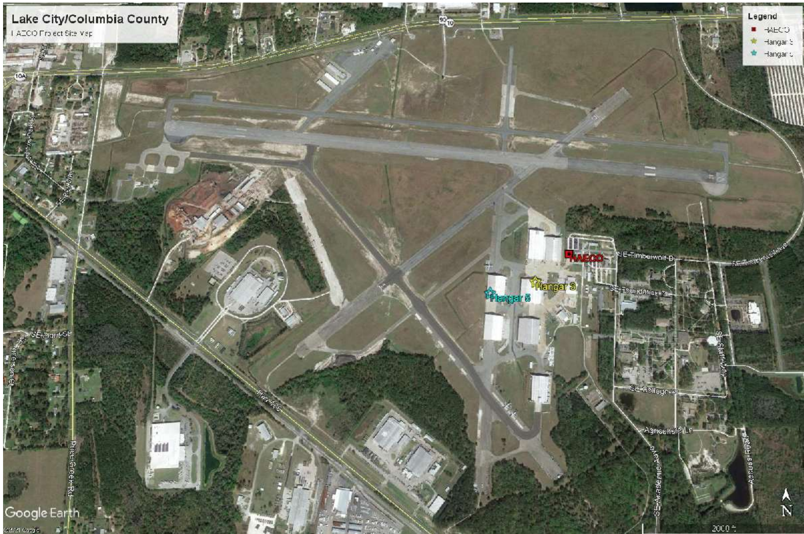
Lake City 2019 ED CDBG Project Location