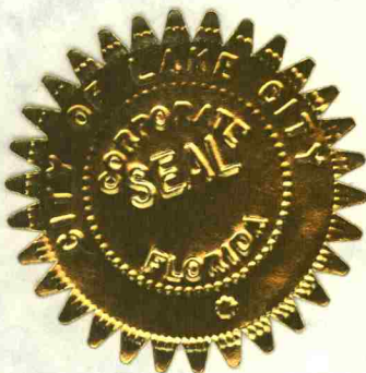
Seal of the City of Lake City State of Florida