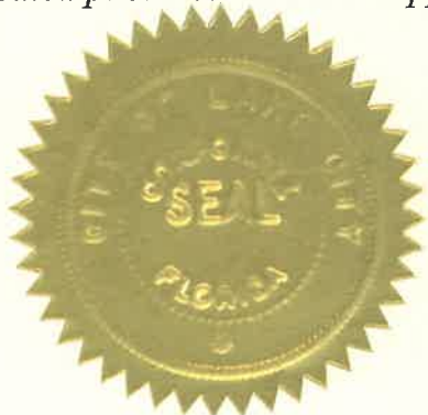
Seal of the City of Lake City State of Florida

NOW, THEREFORE, I, Noah Walker, Mayor of the City of Lake City, Florida, and on behalf of the members of the City Council do hereby recognize Senator Bradley for her dedicated public service and support to the citizens of Lake City.