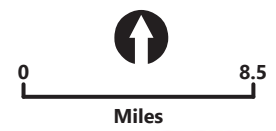
Exhibit Copy _____ Date _____ Lake City Exhibit Copy _____ Date _____ Columbia County Exhibit Copy _____ Date _____ Florida Department of Transportation Exhibit Copy _____ Date _____ Federal Highway Administration

Data Sources: 1. FDOT Roadway Characteristics Inventory 2. U.S. Census