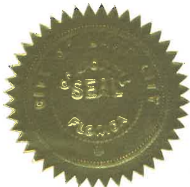
Seal of the City of Lake City State of Florida

I further call upon all citizens of the City of Lake City to observe, Sunday, May 15 th , as Peace Officers' Memorial Day in honor of those law enforcement officers who, through their courageous deeds, have made the ultimate sacrifice in service to their community or have become disabled in the performance of duty, and let us recognize and pay respect to the survivors of our fallen heroes.