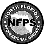
EXHIBIT A NFPS SCOPE OF SERVICES

NFPS agrees to perform for CITY the services as summarized below and further detailed in the FDEP Grant Work Plan (EXHIBIT B) as provided by FDEP Resilient Florida Program. Such services are hereinafter referred to as “SERVICES.”. NFPS shall not perform any other SERVICES outside of what is specifically mentioned below. CITY may elect to add SERVICES at any time through a contract amendment.