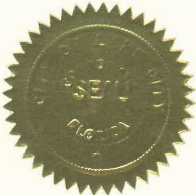
Seal of the City of Lake City State of Florida