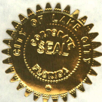
Seal of the City of Lake City State of Florida

NOW, THEREFORE, I, Stephen M. Witt, Mayor of the City of Lake City, Florida, do hereby extend the State of Emergency due to the COVID-19 health concerns for an additional seven (7) days effective October 27, 2020.