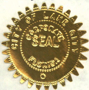
Seal of the City of Lake City State of Florida

NOW, THEREFORE, I, Stephen M. Witt, Mayor of the City of Lake City, Florida, do hereby extend the State of Emergency due to the COVID-19 health concerns for an additional seven (7) days effective October 20, 2020.